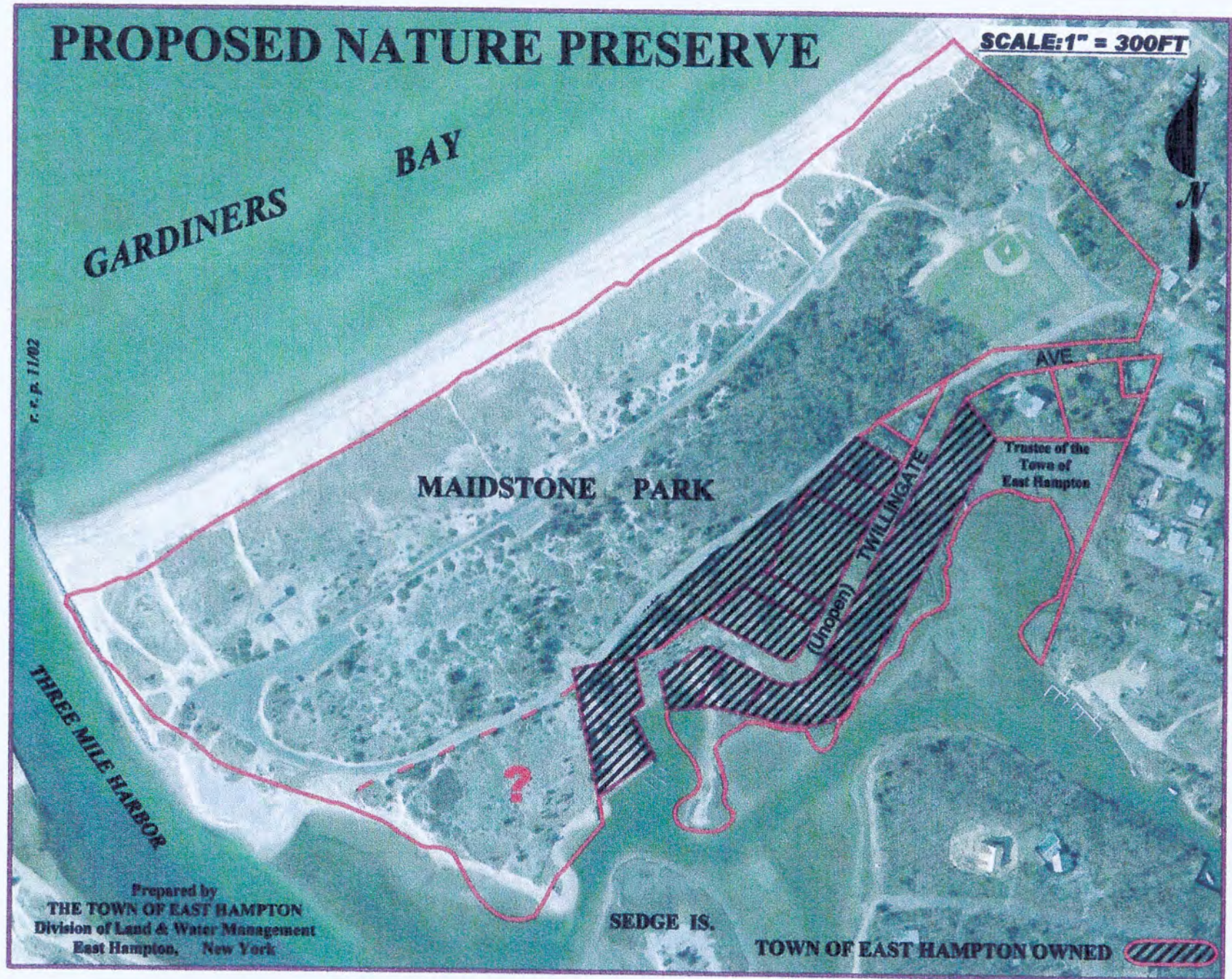
Open Space\Maidstone Area\MaudstoneFinal